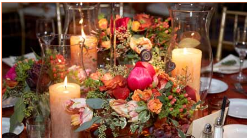
Elegant and festive table decor at the Persimmon Ball.